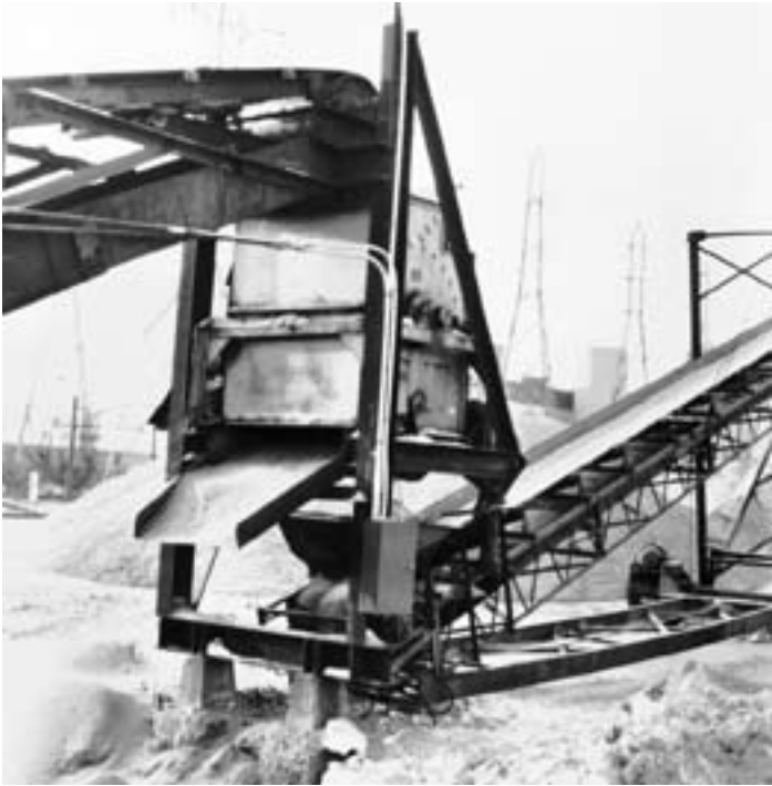
Single Stage DF Separator removing ferrous contamination from slag for use in cement block manufacture.

The special Eriez High Speed Drum Separator at left combines all models of DF Separators into one unit. Used to test a wide variety of materials, it offers a quick, efficient way to determine under controlled conditions which magnetic elements and speeds will provide the best separation for a particular product.